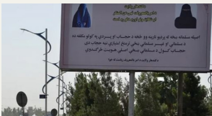
Billboards requiring women to wear full face and body coverings